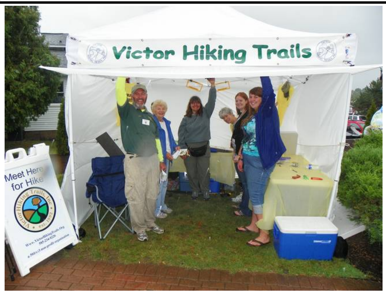
It got a little windy Saturday morning at HAVD when the cold front passed through. Hanging around VHT.