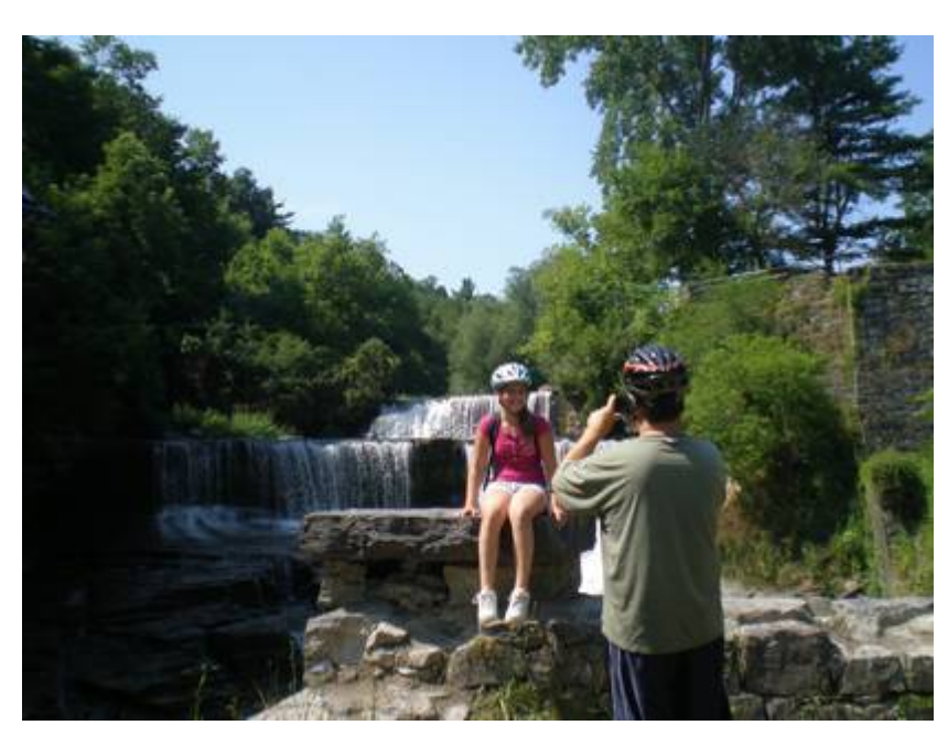
One of the stops along the trail.

July 14– Keuka Lake Outlet Trail bike ride. Six riders went from the downstream end of the Outlet Trail at Dresden to the source of the stream at Penn Yan, a distance of 7.5 miles. Many scenic stops along the way provide rest as we traversed up the slight incline. After lunch in Penn Yan it was a quick return on the down slope. Then we all stopped for a well deserved ice cream before heading back to Victor.