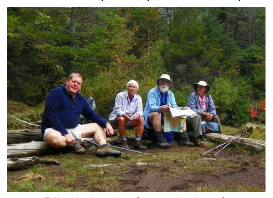
Taking a break or trying to figure out where they are?