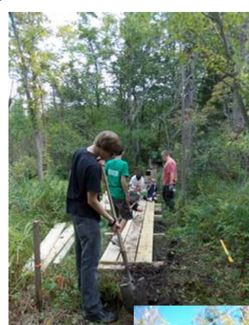
Congratulations to S